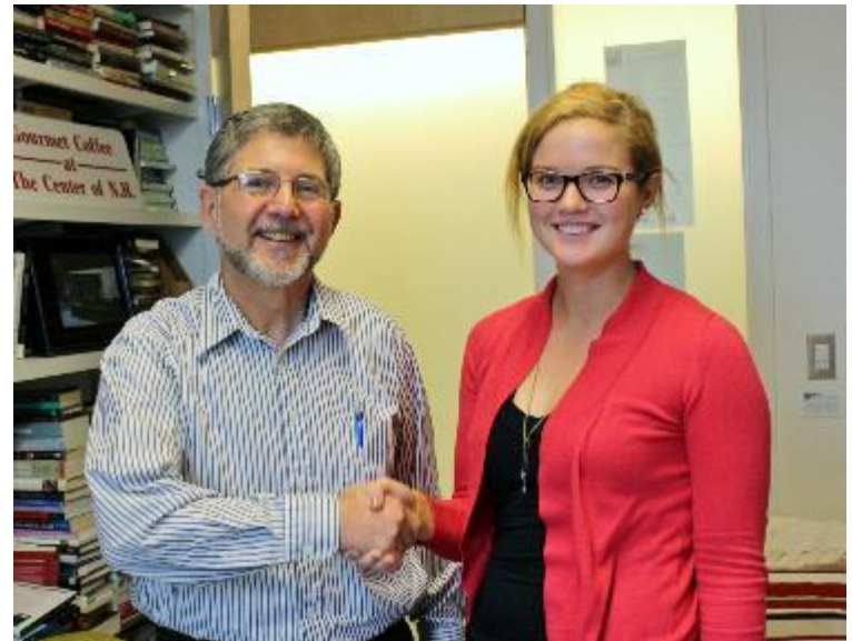
Honors Scholar and her thesis supervisor