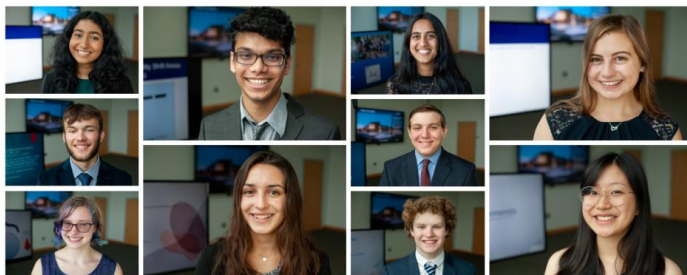
The 2021 Holster Scholars