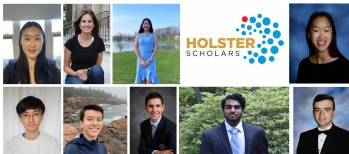
The 2022 Holster Scholars