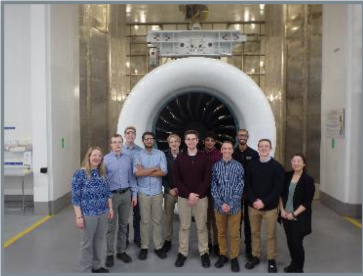
Field trip to Pratt & Whitney.

Honors Education Abroad Honors Congressional Internship Program